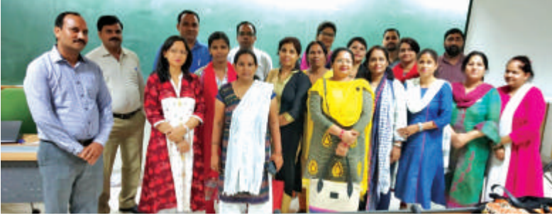
Participants of Training