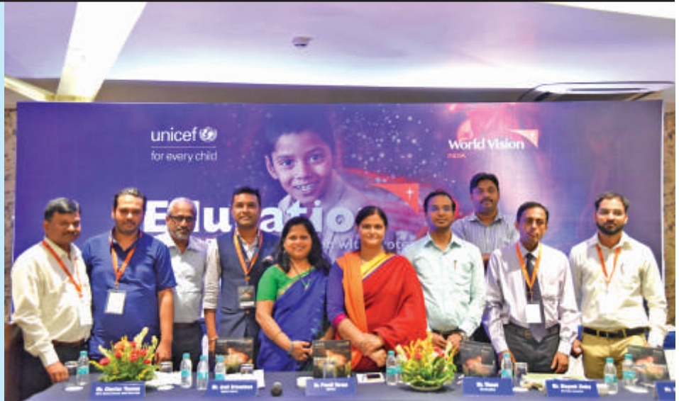
Panelists at World Vision, Education Conclave

Panelists discussed following objectives in detail: