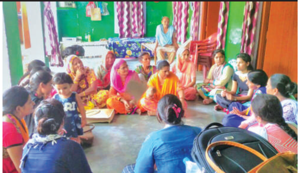
सर्वे के दौरान ग्रामीणों से चर्चा

एक दिन अचानक, मीटिंग बुलाई गई और उस मीटिंग में हम सबको को बताया गया कि शिक्षा इनिशिएटिव प्रोजेक्ट के अंतर्गत एक नया