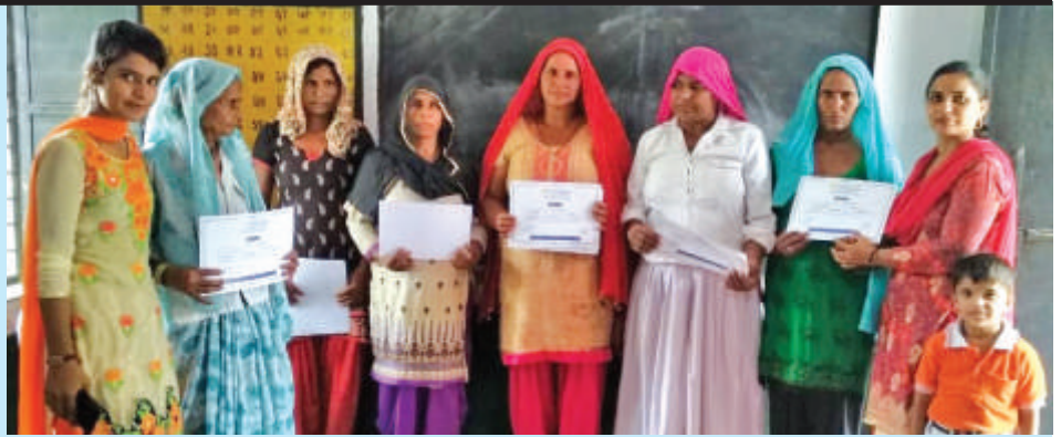
प्रमाणपत्र वितरण के दौरान उपस्थित शिक्षार्थी और अध्यापक

सिकन्दराबाद के ग्राम लालपुर, सराय दूल्हा, वैर बादशाहपुर, हृदयपुर, सलेमपुर कायस्थ, छियासियानगढ़ी, तिल बेगमपुर और दादरी के ग्राम बिसाहड़ा, छौलस, नूरपुर, कठेहरा, और जारचा में शिक्षार्थियों को साक्षर होने के बाद संबंधित गांव के प्राथमिक विद्यालय के प्रधानाचार्यों और ग्राम प्रधान की मौजूदगी में प्रमाण-पत्र वितरित किए गए। ऐसा करने के