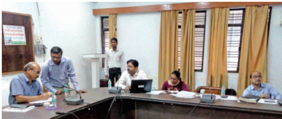
CDO (extreme left) taking an account of various actions