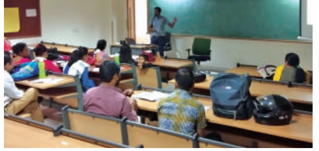
A training session

SHIKSHA Initiative has targeted to increase number of its expansion model schools from 5 to 10 at Centre of Excellence (CoE) in current academic year. These schools are suggested by BSA after round of discussion with SHIKSHA initiative and District Magistrate, Bulandshahr.