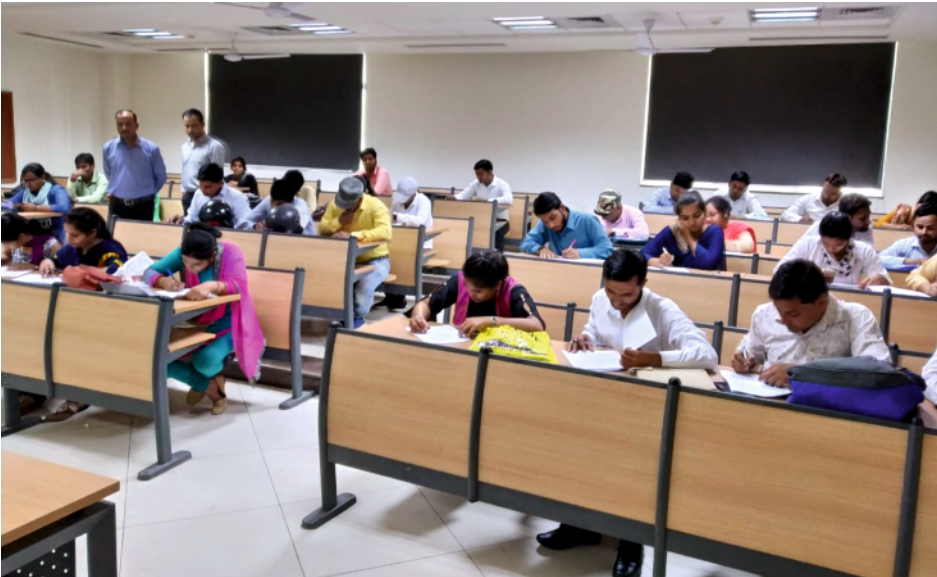
Candidates appearing for written exam during recruitment drive

On May 28, 2019, SHIKSHA Initiative organized a recruitment drive at Shiv Nadar University, Dadri to fill 5 vacant positions of Field Officers. Field Officers