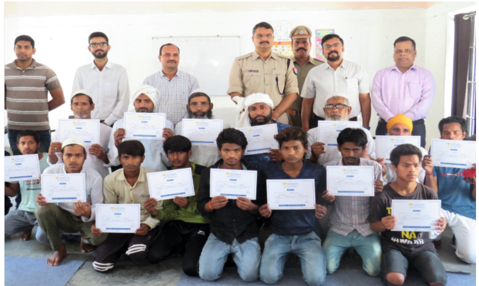
Learners awarded with certificate on completion of the program

SHIKSHA+ program of SHIKSHA Initiative is working to address the issue of adult illiteracy through its profound intervention. In view of the above, SHIKSHA+ expanded its operation in District Jail, Gautam Buddha Nagar. Regular classes were being held for prisoners and on successful completion of the four months of the program, certificate distribution ceremony was held on May 17, 2019. 28 inmate learners were awarded the certificates and in addition 3 instructors were also recognized for their efforts. Moreover, Letter of Intent (LoI) was also renewed between SHIKSHA Initiative and Jail Authorities to continue the program for next year. During the event, Jail Superintendent, Shri Vipin Kumar Mishra congratulated inmates for the successful completion of the program and wished them a bright future. He further acknowledged SHIKSHA+ team to undertake mammoth task and appreciated to continue the program.