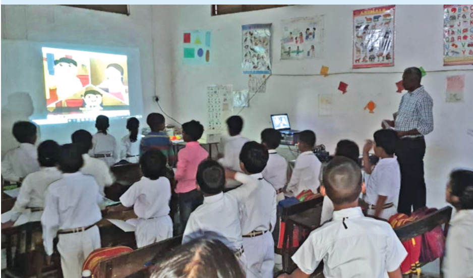
Students performing different activities during UMANG

Centre. Both the visitors observed UMANG during their visit and appreciated the program. Further they added, "This kind of program is really beneficial to motivate students and ensure attendance in class. They also expressed interest to see CMS teaching method which was acknowledged by the teacher. They were pleased to see ICT content and its positive influence on students learning capabilities. Observing the class, they noted active participation of students and teacher-student interaction. They concluded the visit by recording that it can be clearly seen that students are enjoying learning through animated content which will further facilitate their retention capacity. ■